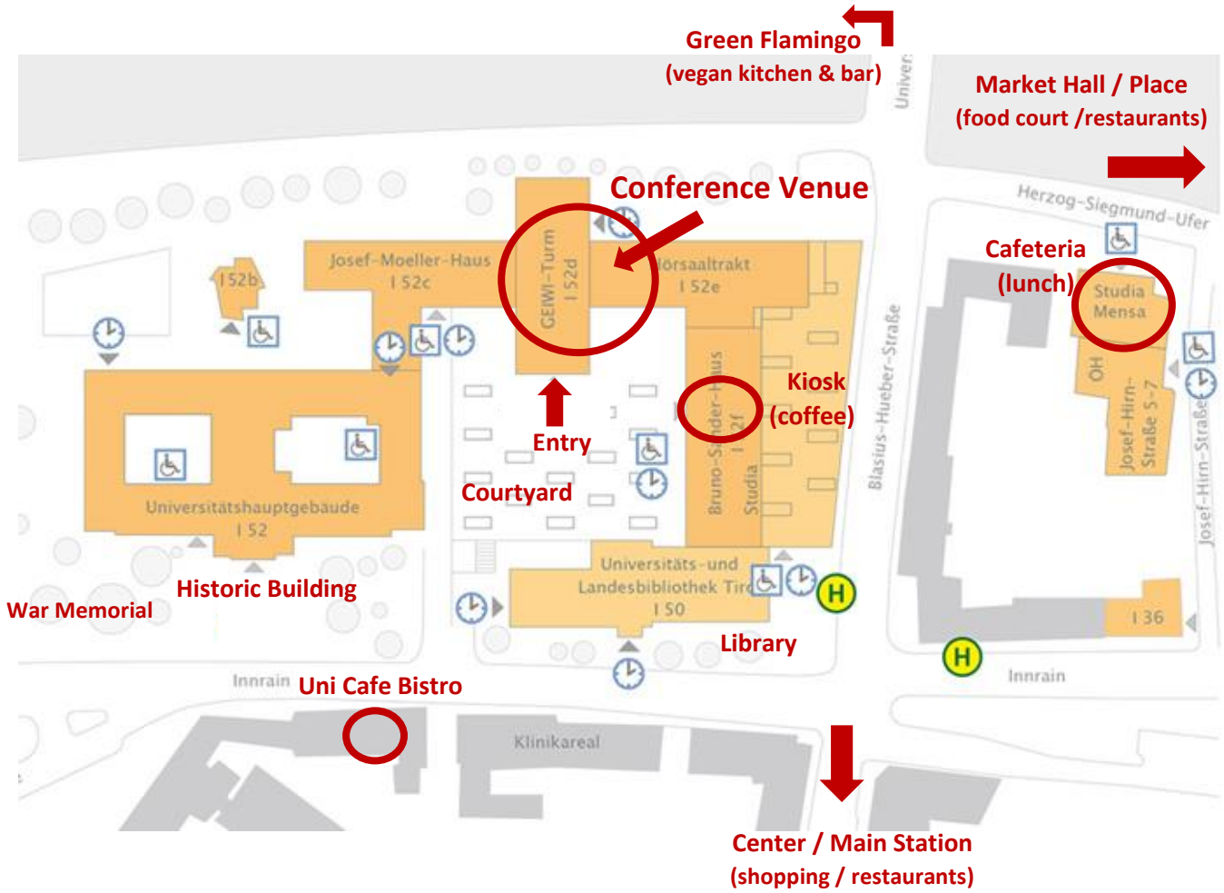
Ground Floor (52d)