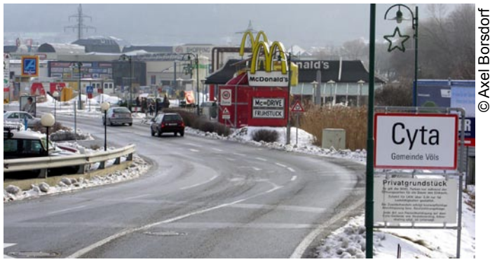
Industrial area in the Inn valley, Austria: Consumer behaviour is considered a main driving force for regional development.

the Alps. Finally, the report further illustrates measures, tools and institutions of regional policy in the Alpine countries. A comparative analysis across the whole Alpine space tries to portray such a regional policy "landscape".