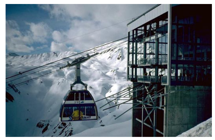
Construction of a new ski lift in France: A generalized development can be observed throughout the Alpine space which highly depends on globally determined location qualities.

Concluding, we remark that the traditional influences of most cultural factors on regional policy are decreasing (while still intuitively present in our perception), leaving an open trail to a generalized development, which generates its peaks and shallows more from globally determined location qualities (like easy access and urbanization, i.e. along the village- metropolis gradient) than from local or regional culture, which in itself tends to become more uniform. Traditional cultural differences then are more an expression of time lags and bound to diminish on the long run. This in turn is a clear signal to DIAMONT: For monitoring regional development in the Alpine Convention context we must not spend to much efforts on indicators based in traditional cultural differences, but more on indicators measuring sustainable progress in a globalizing world. However, this may well include information on regional identity, provided it means not a mere leftover from times past or folklore, but a conscious profile and strategy to future challenges.