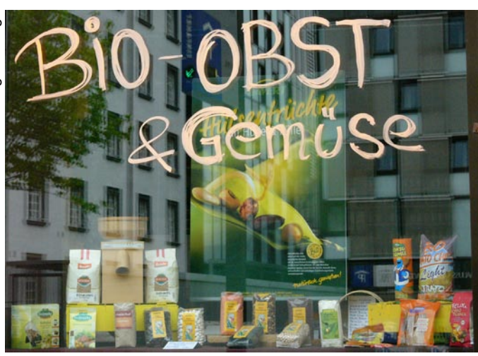
Sustainability can be interpreted as a culture or a certain behaviour like the decision to buy organically grown vegetables.

Considering the normative dimensions of this term, it is evident, that ,culture' in itself is an objective and valuefree concept - we must be especially careful about this just because of the imminent temptation of scaling different forms of culture, of grading different civilizations or aspects of regional cultures. On the other hand, given the context of this study, we should reflect the relation between culture and sustainability, which of course is a normative proposition. In this sense, sustainability may be interpreted as a culture (or behaviour), which cares for the ecological, social, and economic capitals, even trying to mutually increase them. It follows, that of some interest is the question if traditional forms of Alpine cultures were more oriented towards or committed to sustainability, in contrast to actual modes of living, of production and consumption, caring less about these obligations. And even more interesting will be the question, if the future orientation of Alpine cultures might be borne by sustainability, as the Alpine Convention demands. Certainly, this is a trace to be followed.