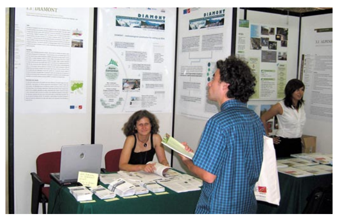
DIAMONT stand in Stresa.