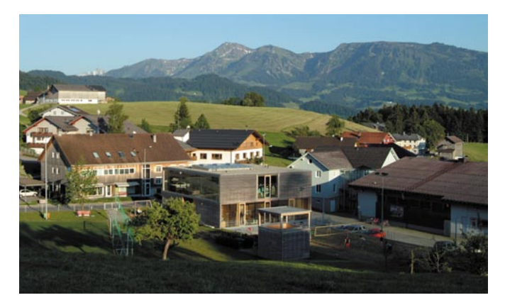
The new multi-functinal centre in Langenegg was jointly planned and constructed only with resources from the region.

Answer: The members of the Alliance for the Alps implement the results of "Future in the Alps", a project on knowledge transfer in the Alps operated by CIPRA International. For example, two Austrian municipalities will dedicate themselves to mobility questions, one of the six main topics in the CIPRA project. While the municipality Werfenweng near Salzburg aims at realising a car-free tourism, the municipality Ludesch in Vorarlberg tries to reduce the commuter traffic flows.