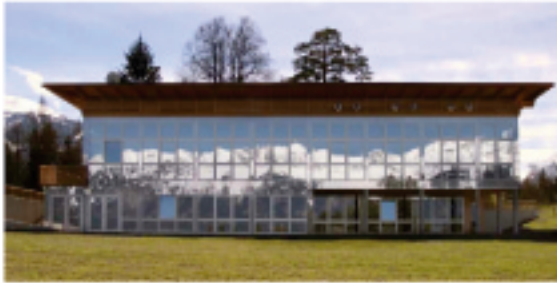
Meeting Center Grillhof Grillhofweg 100 6080 Vill